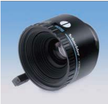
4350 Schneider Lens Apo-Componon HM 4.0/60 mm

Optical design: 8 lenses / 6 elements Lens speed: f/2.0 Focal length: 50 mm Aperture scale: 2-22 Filter thread: 67 mm Dimensions: length 88-91 mm (3.5-3.6 in.), ø 72-75 mm (2.8-3 in.)