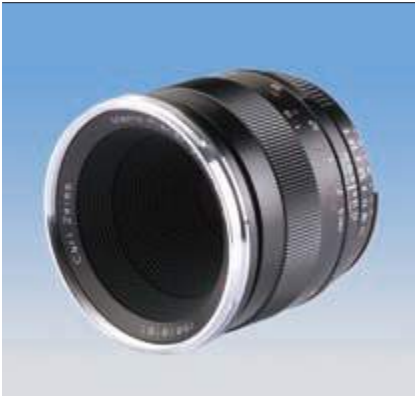
5112 Zeiss Macro-Planar 2.0/50 mm ZF.2

Optical design: 7 lenses / 6 elements Lens speed: f/1.4 Focal length: 50 mm Aperture scale: 1.4-16 Filter thread: 58 mm Dimensions: length 69-71 mm (2.7-2.8 in.), ø 66-71 mm (2.6-2.8 in.)