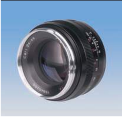
5111 Zeiss Planar 1.4/50 mm, ZF.2

Standard lens for scanning cameras „Scando icoss X“ with Nikon bayonet mount (Scando icoss X/6, X/6 AF, X/N, X/N AF).